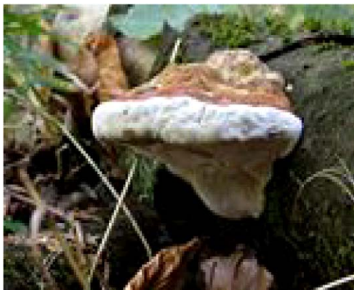
Fig. 1. A typical Ganoderma basidiocarp.

“Lingzhi” is the Chinese name given to the basidiocarps (my preferred name) of Ganoderma as isolated in that vast and diverse country. However, there is a tendency for authors in the scientific literature to refer to such names making definitive conclusions more difficult (see Huie and Di, 2004). The preparation was and is considered to have healing properties to the body and mind: “Lingzhi” is still revered by some. The preparation does indeed contain certain bioactive ingredients (such as triterpenes and polysaccharides) that might be beneficial for the prevention and treatment of a variety of ailments. Remarkably, these include such very important diseases such as hypertension, diabetes, hepatitis, cancers, and AIDS. These types of biomedical investigations have been conducted predominately in China, Korea, Japan and the United States of America and so are extensive. It is unclear why other countries are not more involved.